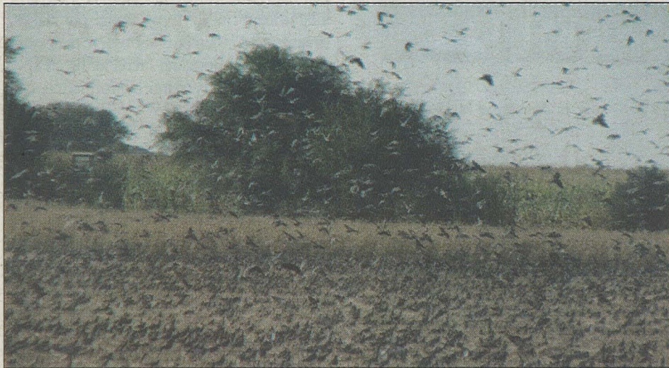
Detail Company Adventures puts hunters where the birds are.